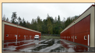
Port tenant 48° North built new hangars at Anacortes Airport.

Regular Commission Meeting/ Joint Meeting with Port of Skagit County Commission Meeting Room 1st and Commercial Avenue