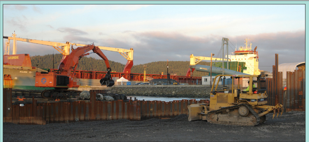
COMMUNITY TOUR: Work continues at Dakota Creek Industries (DCI) on a joint Port/DCI project called "Project Pier 1." Another community tour of the project is scheduled Monday, January 12. Call 293-3134 to RSVP for the 4 p.m. tour.

Last year approximately $1 million was invested by the Port in airport improvements funded in large part by the Federal Aviation Administration (FAA). Improvements include a washdown facility, run-up apron, automated gate and screening berm.