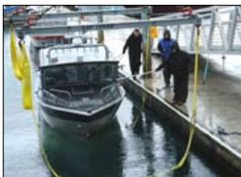
Port of Anacortes staff members deftly moved boats into and out of the harbor over the weekend, drawing the praise of Derby participants.