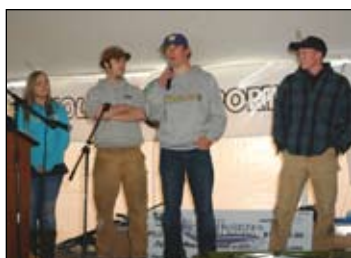
Speaking to a Derby audience were four college students who have received scholarships as a result of the Anacortes Salmon Derby.